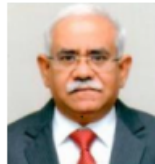
Shri Sudhir Bhargava Information Commissioner