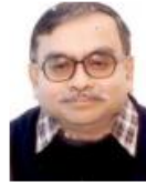
Shri Amitava Bhattacharya Information Commissioner

===== Address: ===== CIC Helpline Number : 011-61117666