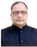
Shri Bimal Julka Information Commissioner